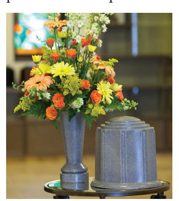
as steel, as beautiful as stone, but with an airtight/watertight seal that protects against flooding and other problems, indoors or out.

Theft isn't the only problem. The looks and integrity of conventional materials also suffer from normal exposure to the elements. ForeverSafe products are impervious to surrounding conditions. They're as tough